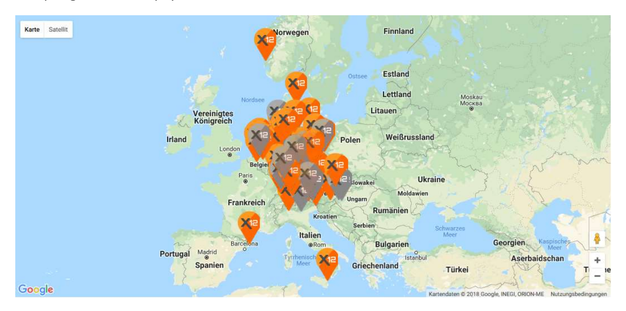
You can check out the complete list of these merchants here: http://x12coin.com/x12-map/

We are proud to see that numerous merchants have already expressed their willingness for accepting X12Coin as payment: